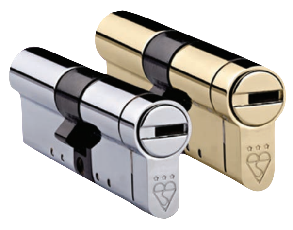
Example of a TS 007 3 Star Europrofile lock

Therefore, fitting a 3 star cylinder and a 2 star handle enables the maximum level of security provided by the TS 007 testing process (5 stars). The minimum level of security you should look to achieve is 3 stars, which could either be done by fitting a 3 star cylinder on its own or by fitting a 1 star cylinder in combination with a 2 star handle. A 3 star cylinder is the preferred option given it provides the maximum level of security for a lock under the TS 007 testing process.