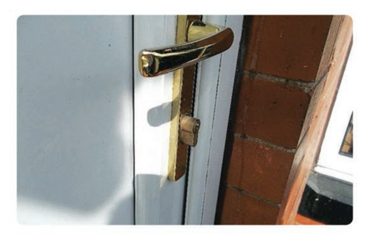
Incorrectly measured lock protruding from the door handle